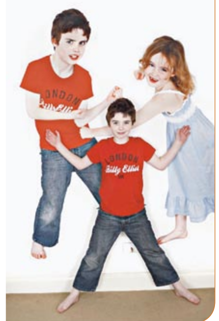
Image: Silhouette (cut-out) figures Revivawall 36 inch panels uncoated and butt joined. Printer: Epson 9800

Where ever you choose to use Revivawall, you can be assured that the printed image is archival when printed with pigment inks and is water resistant with those inks.